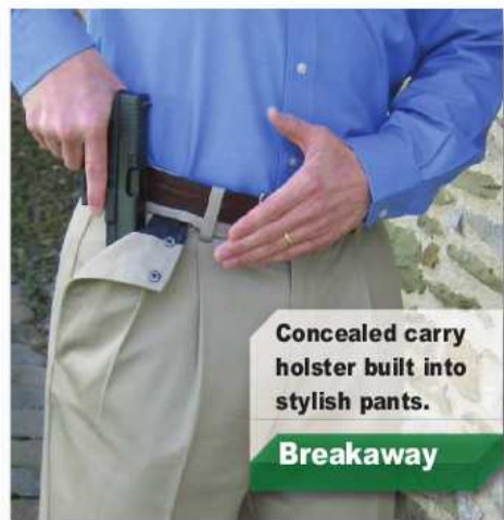
Concealed carry holster built into stylish pants.

new methodology for concealed carry and a new era for tactical proficiency. Normal-looking business and casual clothing. No untucked shirt, vest, jacket or extra clothing