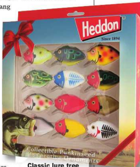
Classic lure tree ornaments.

You get a dozen Collectible Punkinseed Decorative Ornaments in a holiday themed box, perfect to give the angler who has everything. They look great on a Christmas tree or hung in a lake cabin or retreat. For more information, go to www.lurenet.com .